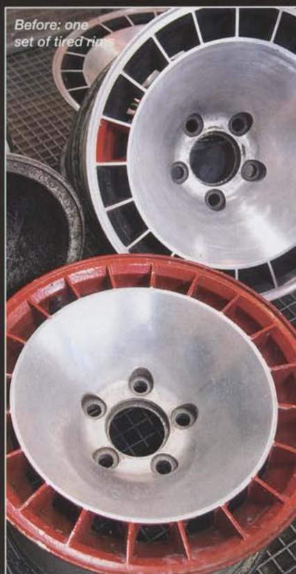
Before: one set of tired rims